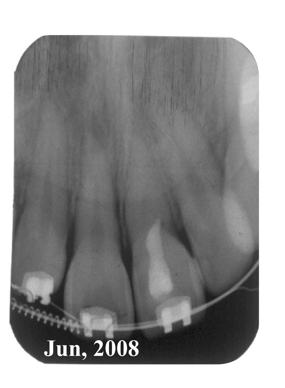
Fig 5. During the first 16 months of orthodontic treatment, the tooth was stable.

The patient received orthodontic treatment to solve crowding and protrusion problems when she was 13 (6 years after injury).