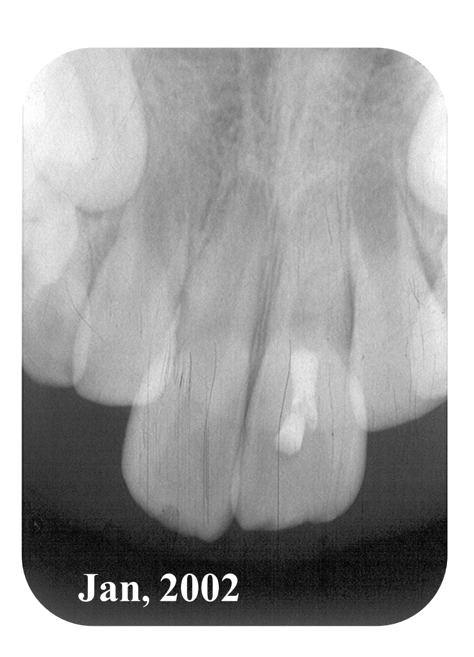
Fig 3. 8 months later, almost normal root length development was completed.

In the first 5 months, tooth 21 was asymptomatic, and radiographic examination showed root development (Fig 2). Toothache occured at 6th month. The diagnosis was pulpitis and apexogenesis was performed.