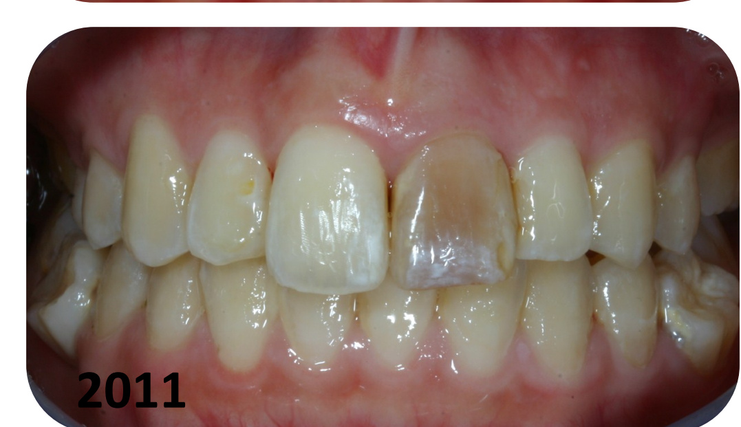
Fig 8. Before and after orthodontic treatment.

Orthodontic treatment lasted 2.5 years. No progressive resorption was observed afterwards (Fig 7). Finally, the tooth was restored with ceramic veneer for esthetics.