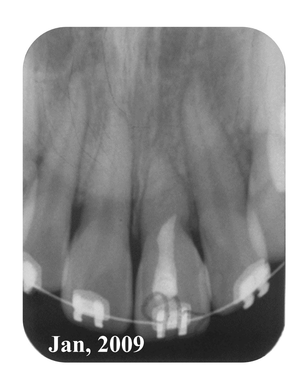
Fig 6. In the next 6 months, the apical third of the root was gradually resorbed.