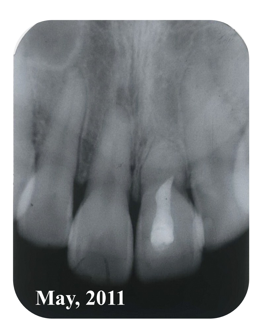
Fig 7. 20 months later, there was no further resorption after orthodontic force reduction and appliance removal.