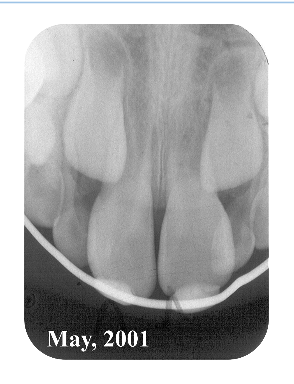
Fig 1. Immediate after replantation.

•Treatment procedure: the avulsed 21 was immersed and washed in normal saline for 20 min until root surface was clean. Put the tooth back into its socket, stabilized for 4 weeks using flexible splint (Fig 1).