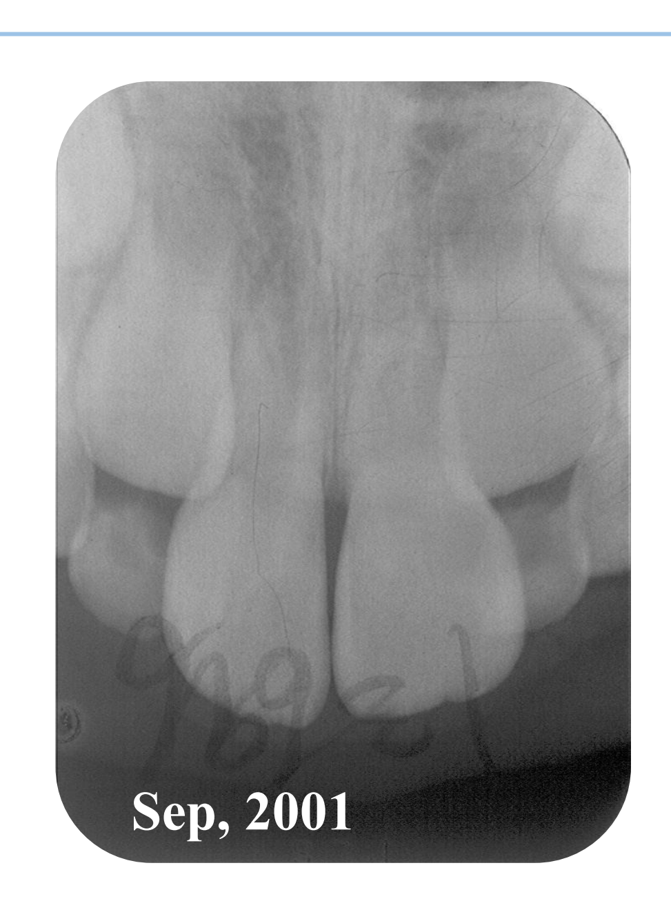
Fig 2. The root continued to develop without symptom.

In the first 5 months, tooth 21 was asymptomatic, and radiographic examination showed root development (Fig 2). Toothache occured at 6th month. The diagnosis was pulpitis and apexogenesis was performed.