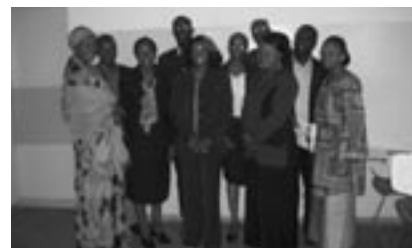
African participants at the meeting