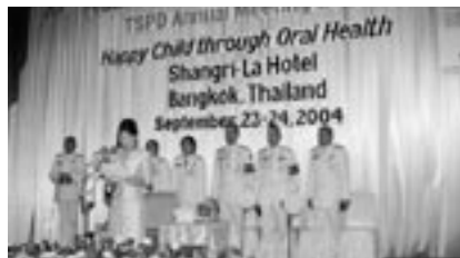
Her Serene Highness Princess Sirivanwari Mahidol at the Opening ceremony

The 4th Conference of the Pediatric Dentistry Association of Asia (PDAA) was held to great success on 22-24 September, 2004, in Bangkok, Thailand. It was jointly hosted by the Thai Society of Pediatric Dentistry, Chulalongkorn and Mahidol Universities of Thailand. The elaborate opening ceremony was honoured by the presence of Her Serene